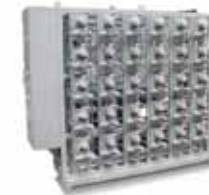
Solenoid valve board