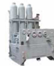
Hydraulic power unit